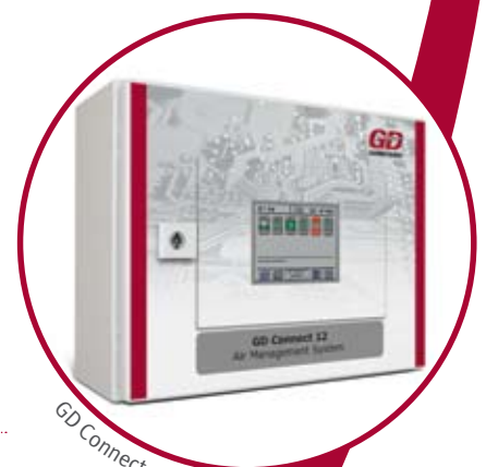
GD Connect 12